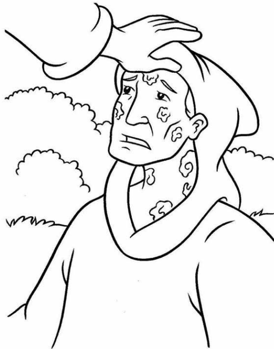
Jesus touched the man and he was cured of leprosy