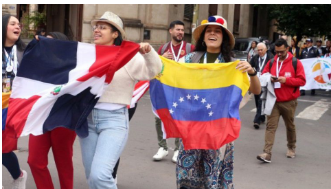
XXI Encuentro Latinoamericano de Responsables Nacionales de la Pastoral Juvenil.

El Santo Padre los incentiva a trabajar por la justicia que hace a la paz efectiva y duradera, edificar el bien común y fecundar la felicidad de la Patria Grande que conforman los pueblos latinoamericanos para seguir acrecentando el Reino de Dios.