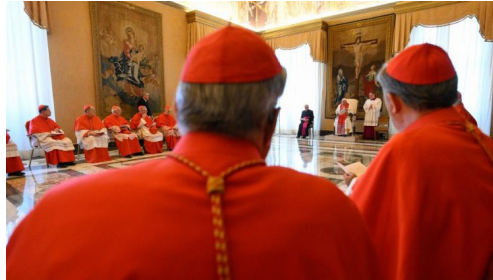
El Papa en el Consistorio Ordinario Público para la Canonización de algunos Beatos