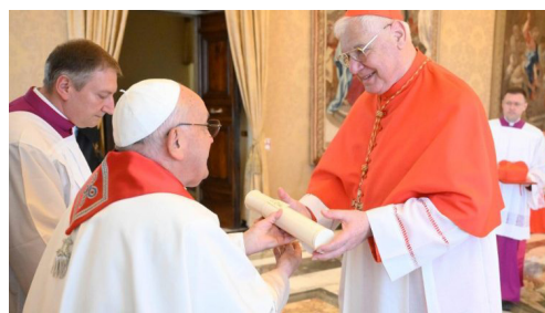
Consistorio Ordinario Público para la Canonización de algunos Beatos

Asimismo, se informa que, "el Beato Carlo Acutis será inscrito en la Lista de los Santos en una fecha por determinar". Probablemente la canonización del joven laico se realizará durante el Jubileo de 2025 junto con otras canonizaciones.