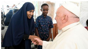
Una mujer afgana saluda al Papa

El vuelo papal aterrizó esta mañana en el aeropuerto Soekarno-Hatta de la capital, Yakarta, primera escala de un largo viaje apostólico que le llevará también a peregrinar a Papúa Nueva Guinea, Timor Oriental y Singapur hasta el 13 de septiembre. Francisco se dirigió a la Nunciatura Apostólica, en la zona central de la capital. Desde las calles, hombres, mujeres y niños con camisetas blancas ondeaban banderas con los colores de Indonesia y gritaban «Selamat datang», «bienvenido», al paso del coche papal.