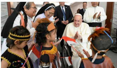
Algunos de los niños presentes en la reunión en la Nunciatura

Apenas llegó el Papa a la Nunciatura Apostólica, tuvo un encuentro con un grupo de 40 hombres, mujeres, ancianos y niños asistidos y acompañados por las hermanas dominicas, el Servicio Jesuita a Refugiados y la Comunidad de Sant'Egidio. Escuchó sus testimonios, entre ellos el de una familia de refugiados de Sri Lanka y un refugiado rohingya.