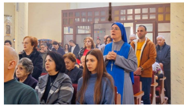
People attending Holy Mass led by the Patriarch of Jerusalem at Holy Family parish on December 22, 2024

He expressed his hope that the international community will help provide aid to the people in the Gaza Strip.