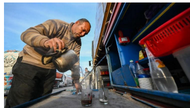
A driver makes tea next to his truck loaded with aid as he waits to cross into Gaza from the Egyptian side of the Rafah border